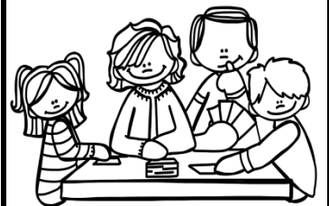
BEING WITH OTHERS